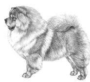
Chow Chow Cousin breed

Registration: Canadian Kennel Club FD- FN3971723