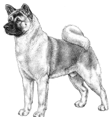
Akita Sibling breed