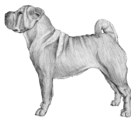
Chinese Shar-Pei Cousin breed